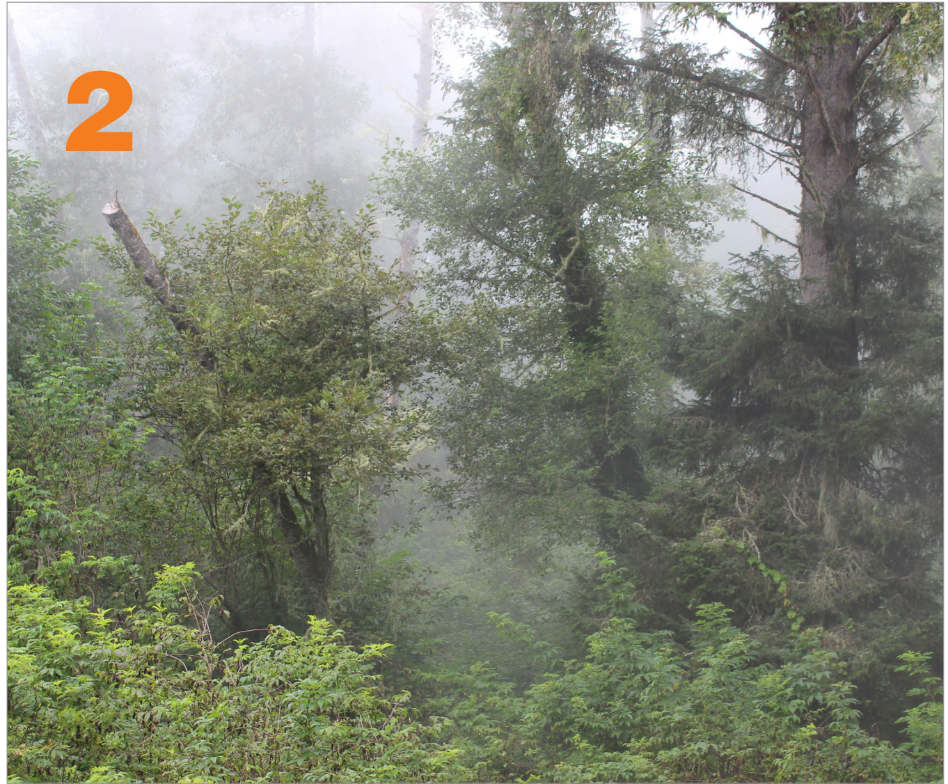
View from northbound U.S. 101, looking northeast