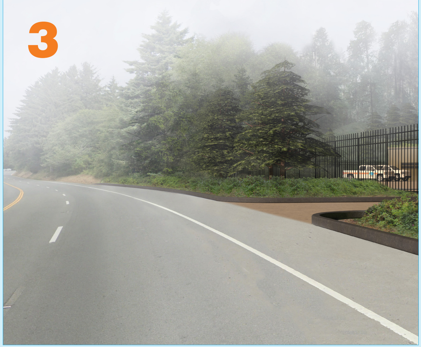
Proposed Operations and Maintenance Center (OMC)