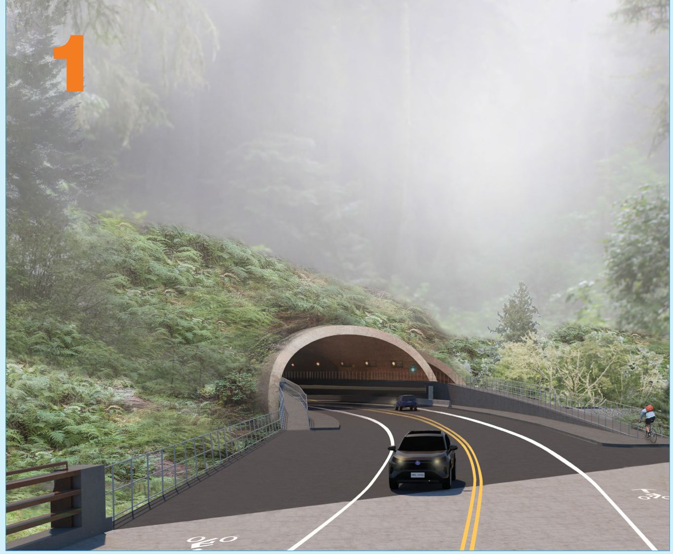
Proposed North Tunnel Portal and Approach