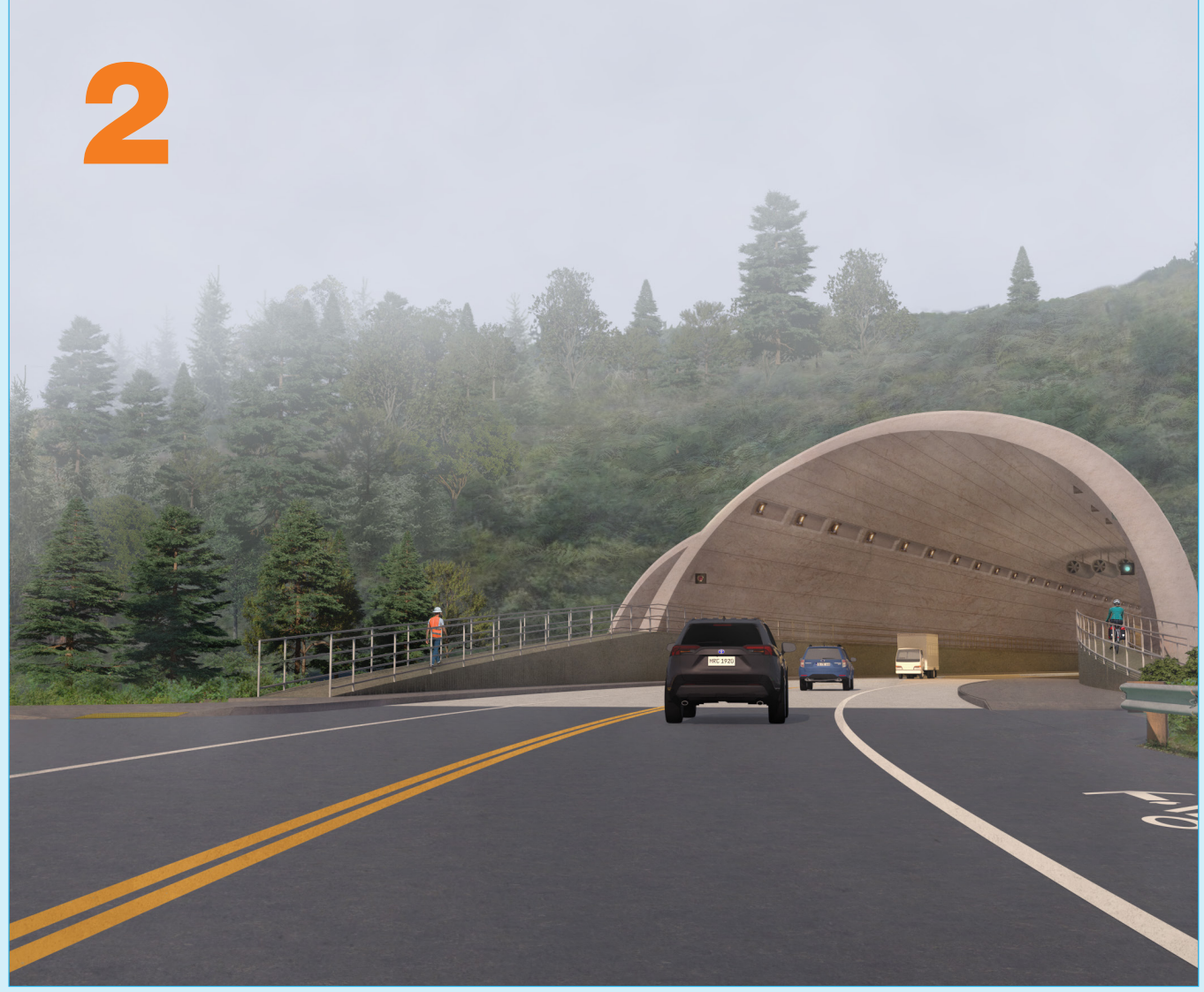
Proposed South Tunnel Portal and Approach