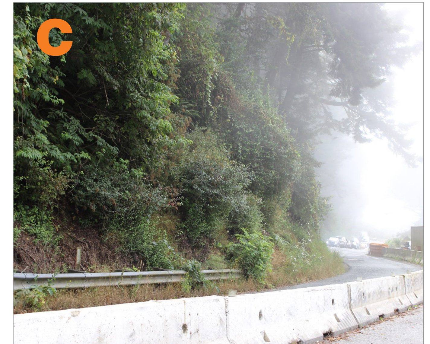
Southbound view from point just south of proposed 150' highway realignment