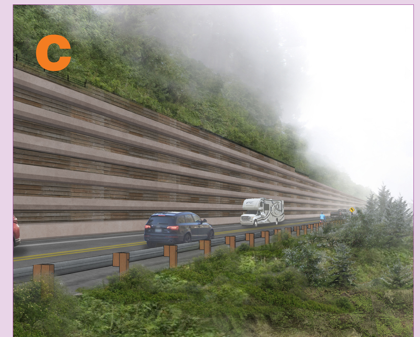
Proposed Highway Realignment and Retaining Wall viewed from Southbound U.S. 101