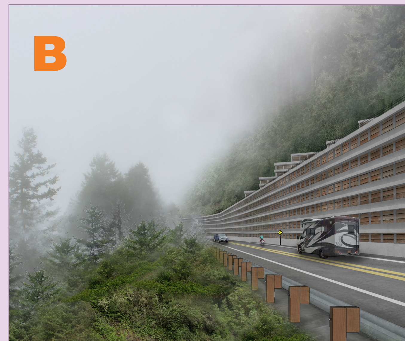
Proposed Highway Realignment and Multi-Tiered Retaining Wall viewed from Northbound U.S. 101