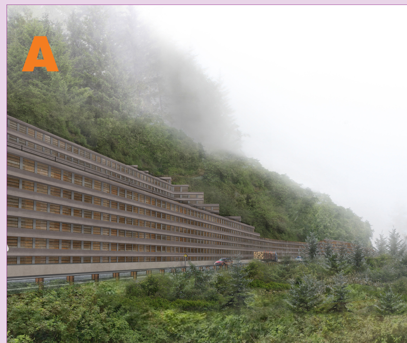
Proposed Highway Realignment and Multi-Tiered Retaining Wall viewed from Southbound U.S. 101