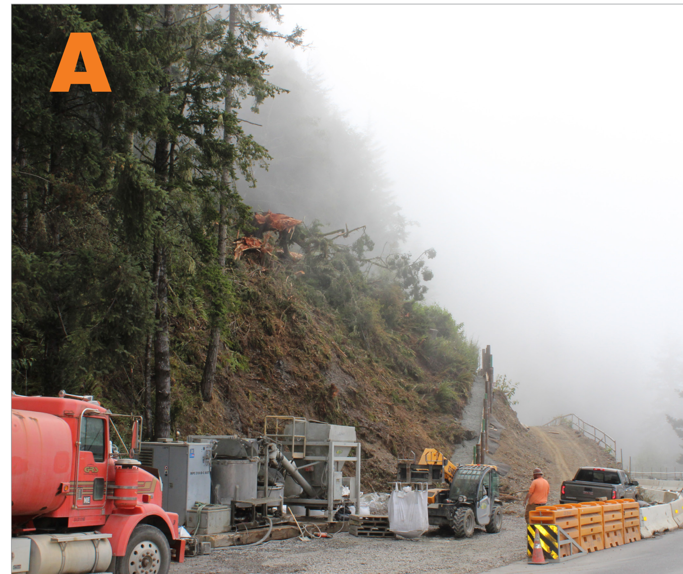
Southbound view near north end of proposed 150' highway realignment