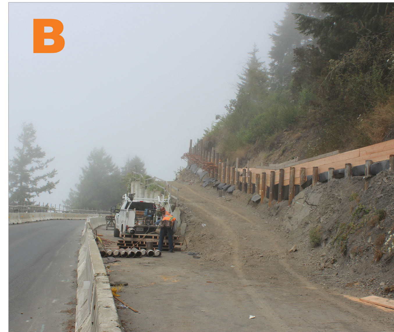
Northbound view from south end of proposed 150' highway realignment