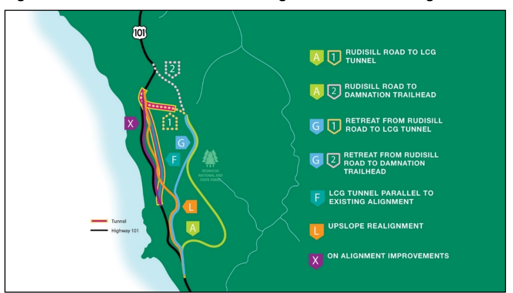
Figure 3. Alternatives Considered During 2020/2021 Screening Process

Table 1. Alternatives Considered during 2020/2021 Screening Process